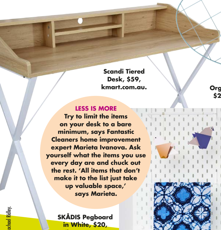
Scandi Tiered Desk, $59, kmart.com.au.