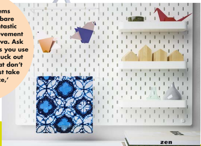
SKÅDIS Pegboard in White, $20, ikea.com.au.